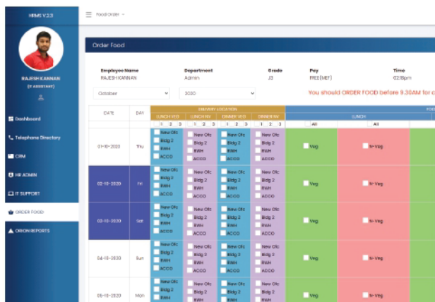
FOOD ORDER SYSTEM